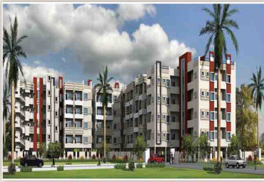
INDU VATIKA in front of Radio Station