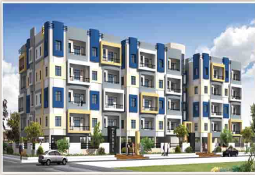
SHREE CHAMAN near to Mango Market