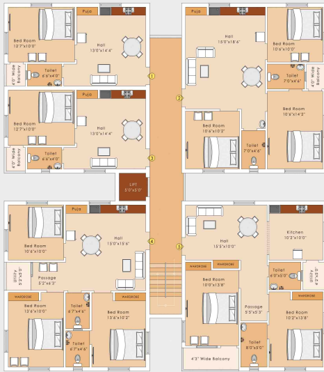
TYPICAL PLAN OF TRIPASURI VENKAT SAROJINI NILAYAM